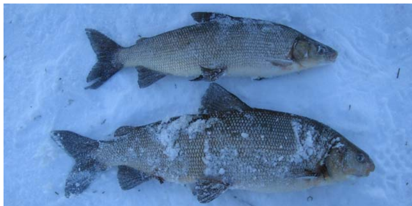
Lake Whitefish (top) Broad Whitefish (bottom)

The longest broad whitefish was 21.2 inches (river south), and the longest lake whitefish was 21.5 inches (lake) (Table 1.). The diversity of species increased when fishing in the main lake opposed to either river. The largest northern pike was 37.56 inches, and 12.68 pounds. The largest lake trout was 44.3 inches, and 22.4 pounds. The average size of Cisco was 6.3 inches, and 0.1 pounds, with the largest being 13.2 inches and 0.9 pounds (Table 3.).